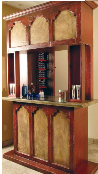
Watch your special color prescription formula being mixed at the color bar.

GentleWaves is a non-invasive procedure used to reduce fine lines, pore size and skin discoloration. After a series of eight, twice-a-week treatments, (and